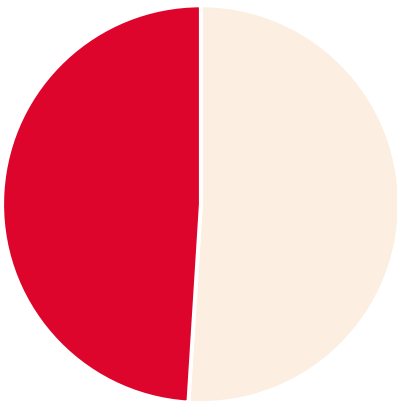
Gender diversity at interview